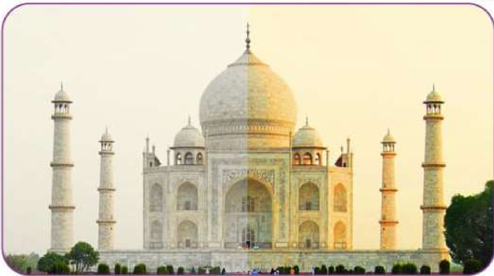
Before and After effects of acid rain on the Taj Mahal